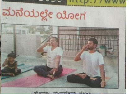
ANANDA YOGA EDUCATION AND RESEARCH INSTITUTE